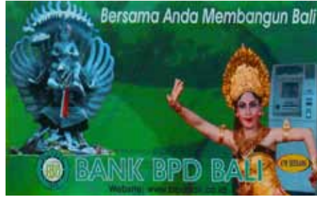
Dance (Olèg Tamulilingan) and religious offerings being used to sell branded products

Everything becomes rewritable through the mass mediation of signs to meet the demands of constructed brand identities. Consumption turns out to be